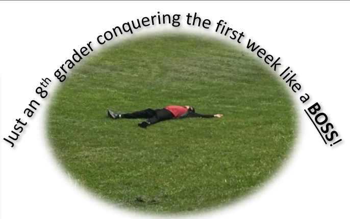
TLS Faculty-Prayer Retreat